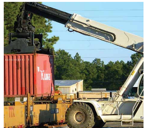
Cordele offers overnight service to GPA's Garden City Terminal.